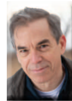
The Two Sides of James J. Strang

Miles Harvey discusses his new book, THE KING OF CONFIDENCE , which sheds new light on the man who ruled Beaver Island as a quasi-independent kingdom in the mid-19th century. Was Strang a swindler or a social reformer? Harvey reveals previously unknown evidence about both sides of Strang's complex personality.